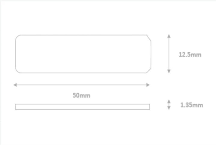
Measurements shown in mm